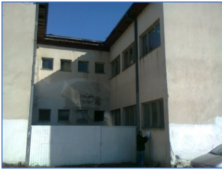
Situation before rehabilitation