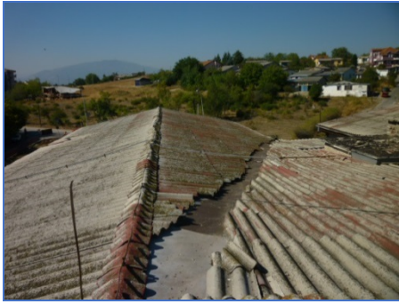
Situation before rehabilitation